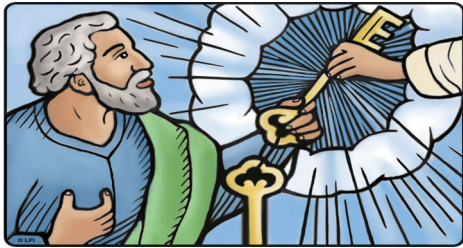
21st Sunday in Ordinary Time