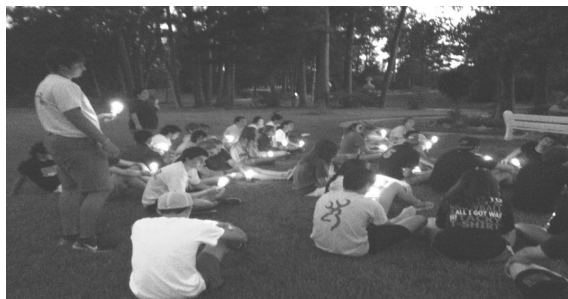
(Candlelight gathering of Confirmation students at the Retreat.)

A big THANK YOU to all volunteers and participants who attended the Confirmation Retreat. It was a beautiful experience of faith-sharing and fun. We truly have some modern day saints among us at St. John the Baptist.