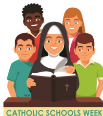
CATHOLIC SCHOOLS WEEK