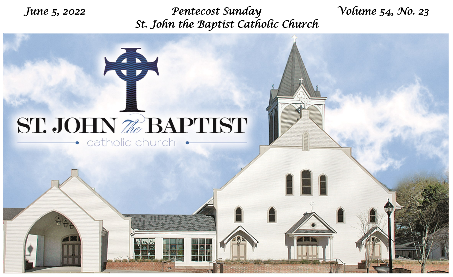
402 South Kirkland Drive (River Road)